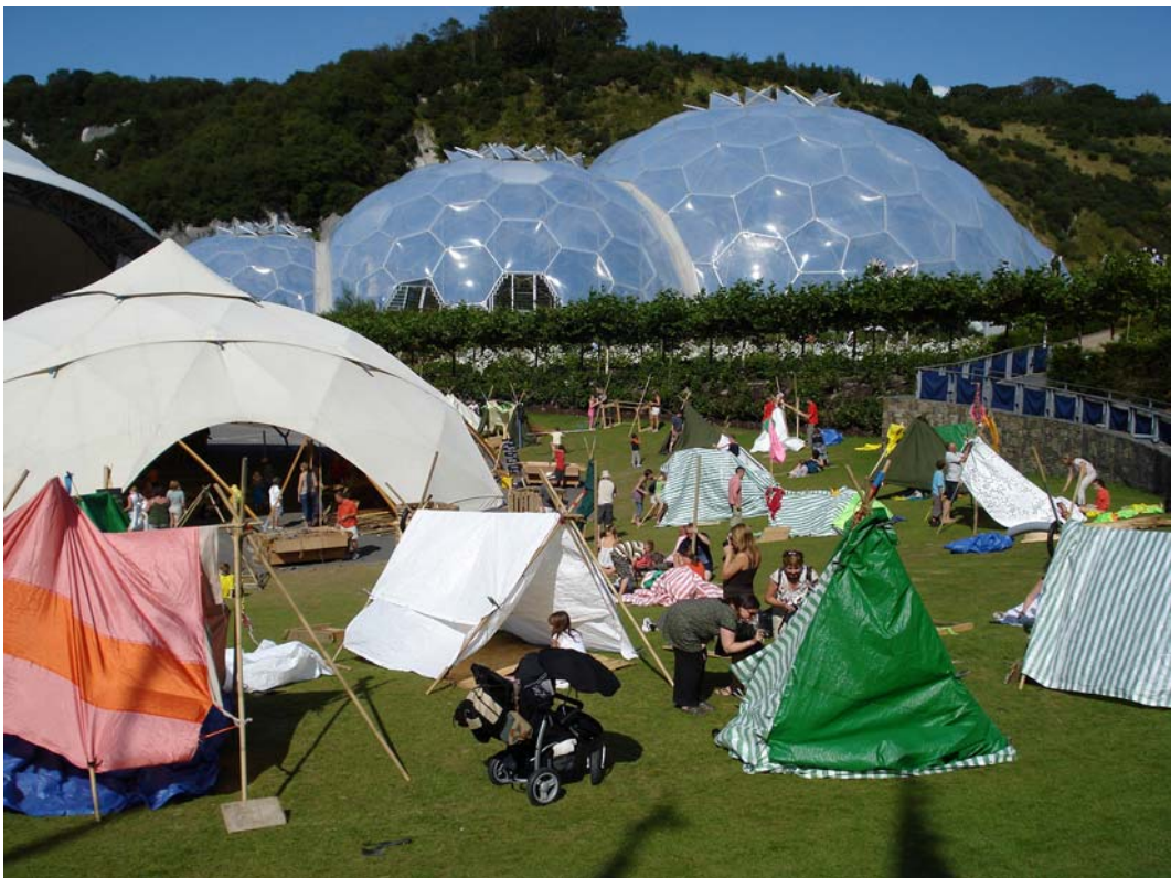
Summer Survival Challenge. Families enjoy making dens outdoors with a view of the Biomes in the background.