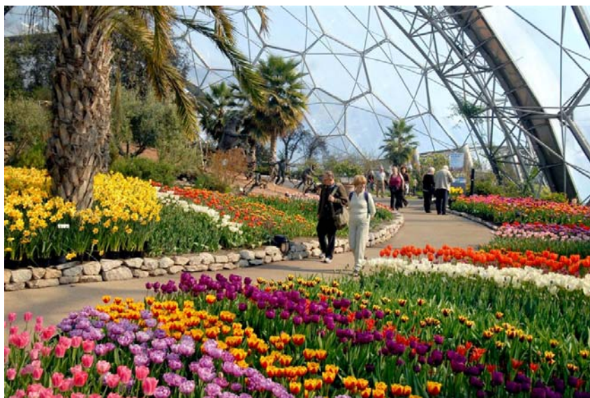
The Mediterranean Biome. Visitors enjoy the rainbow colours of rows of tulips throughout the Biome.