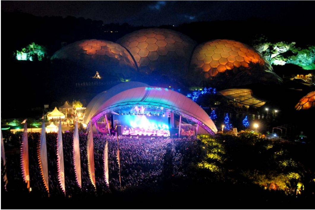
Eden Sessions. A view of a night-time concert with the Biomes lit up.